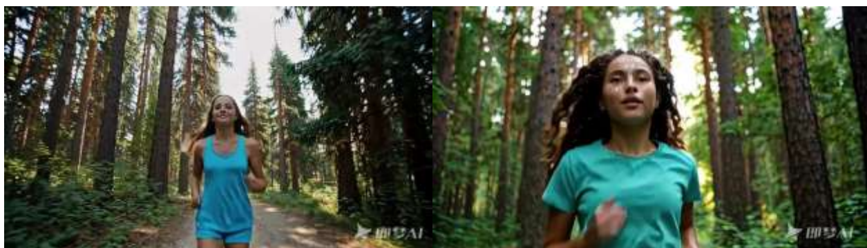
Figure 4. AI-generated videos have inconsistent characters in different shots.

In addition to image detail issues, videos generated by AIGC also have significant problems ensuring consistency between the beginning and end of the video. Even multi-modal AIGC tools find it difficult to guarantee this. For example, it is challenging to ensure that a girl running is wearing the same clothes in different generated shots (Figure 4).