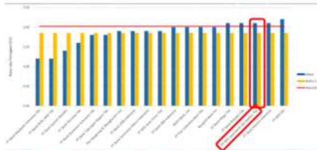
Figure 1. Comparison of bank BJB Average GCG Ratings Against Each Bank With Category of BUKU 3 and Industry Standards (LPPI, 2018)

Based on Figure 1 above, the bank BJB GCG Self Assessment average is still above the BUKU 3 GCG value standard and the national banking industry standard (not good).