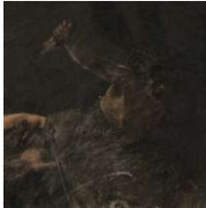
Figure 3. Manual Painting and Recolorization

deavor exposed the confines of human interpretation and craftsmanship in achieving a comprehensive restoration.