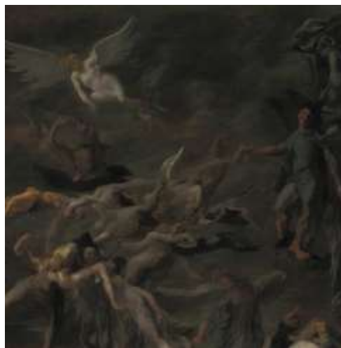
Figure 4. Artificial Intelligence-based Restoration

Transitioning to computational methodologies, Stable Diffusion was employed with defined parameters: a prompt strength of 50%, a guidance scale of 7.5, and an initial set of 25 inference steps ( Figure 4 ). A notable curiosity emerged: the algorithm interpreted damaged areas as distinct celestial entities rather than executing the intended restoration. These findings underscore Xiaoli Yu et al.'s (2021) assertion that AI systems lack an intrinsic understanding of artistic intentionality, thus necessitating human oversight.