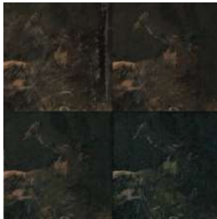
Figure 6. Effects of Inpainting

A granular examination of the 'inpainting' effect was conducted through a sequence of iterative rounds ( Figure 6 ). Although the initial rounds successfully ameliorated surface blemishes, these enhancements compromised the painting's chromatic fidelity and nuanced details, particularly evident in the depiction of Achilles. Multiple rounds led to nearly complete effacement of scratches but precipitated an undesirable shift in the color profile and a loss of fine details. Such observations echo the broader academic consensus that AI techniques, though powerful, require cautious application to prevent inadvertent degradation (Xiaoli Yu et al., 2021).