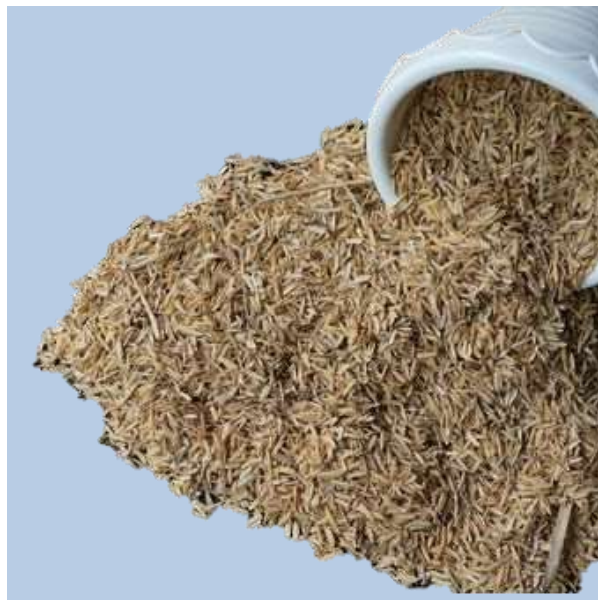
Figure 1. Rice husk

In this study, epoxy resin and hardener were mixed using a hand mixer in a measuring cup for 7 minutes. The ratio of epoxy and hardener used in this study was 3:1. Rice husk with a weight fraction of 50% was poured into the epoxy resin which was then stirred for 10 minutes using a hand mixer. The material was poured into a mold that had previously been coated with a release agent. After pouring into the mold and the mixture of materials is leveled according to the height of the mold using a roller or brush. The formed composite is then dried for 24 hours in the mold at room temperature. After that, the formed specimens were cut to produce specimen dimensions in accordance with ASTM for density, hardness, and impact testing.